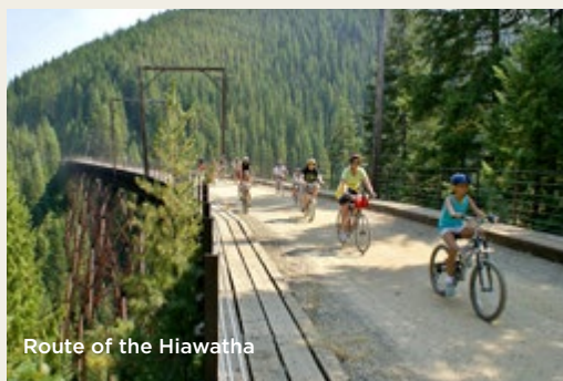
Route of the Hiawatha