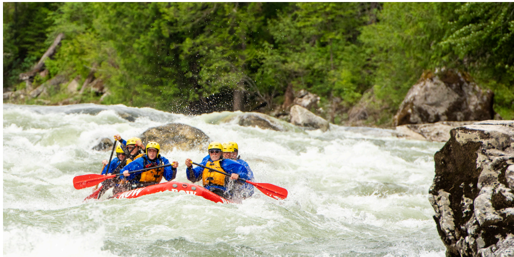
Above: Rafting, Lochsa River, near Kooskia