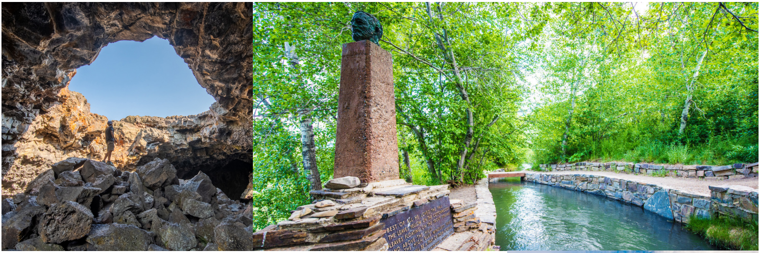
Clockwise: Craters of the Moon National Monument and Preserve, near Arco; Ernest Hemingway Memorial, Sun Valley; Warfield Distillery & Brewery, Ketchum

After a day of riding, head into the heart of Ketchum for a well-deserved bite to eat. Warfield Distillery & Brewery serves up delectable dishes of sustainably sourced food paired with craft beer concoctions like Goat Sweater Amber and handcrafted cocktails using Warfield’s own small-batch gin, vodka and brandy. The rooftop deck is a perfect spot to relax and enjoy the views of Bald Mountain and celebrate a day of adventure.