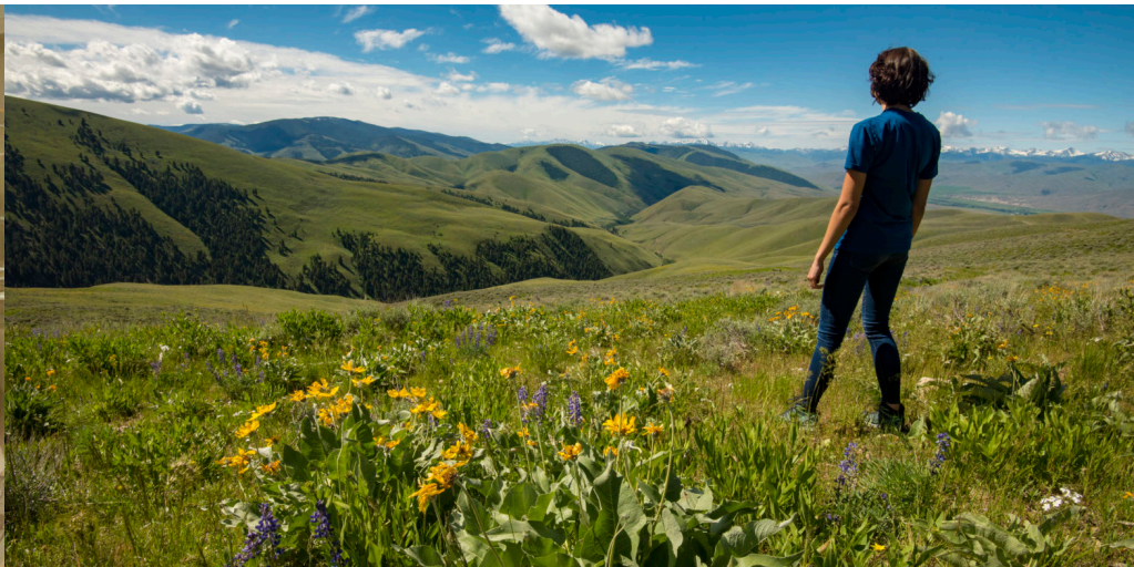
Clockwise: Nez Perce National Historical Park Visitor Center, Spalding; Lewis and Clark Back Country Byway, near Tendoy; DeVoto Memorial Cedar Grove, near Lowell; Northwest Passage Scenic Byway, near Kooskia

good night's sleep. Once rested, wetsuit up with a river outfitter, like ROW Adventures , to tackle the splashy, thrilling rapids of the Lochsa River. With more than 40 rapids in a 30-mile stretch, you're sure to earn your paddle prowess on this mighty Idaho river. But don't worry, if this river isn't quite your speed, there are more than 3,100 river miles to explore in Idaho with rapids that are just right for your crew.