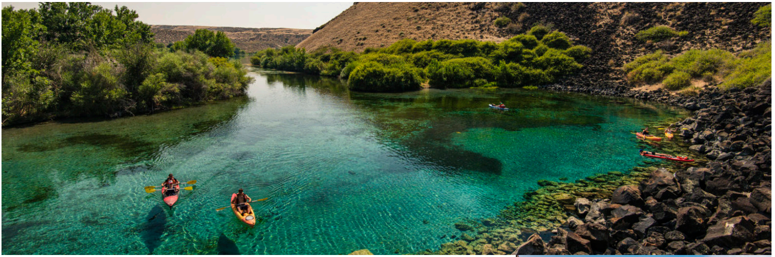
Clockwise: Blue Heart Springs, near Hagerman; Shoshone Falls, near Twin Falls

only legal object for BASE jumping thrill seekers. On calm days, you might see a handful of parachute-wearing daredevils take the nearly 500-foot leap to the Snake River canyon floor below.