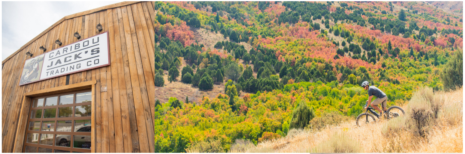
Clockwise: Caribou Jack's, Soda Springs; Mountain Biking, Pocatello; Hiking Bloomington Lake, near Bloomington; Bloomington Lake, near Bloomington

pedaling. If you didn't pack your bike and gear, make a stop at Barrie's Ski and Sports to rent bikes, a rack for your vehicle, and whatever else you need for your two-wheeled adventure.