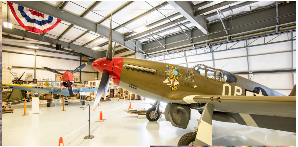
Clockwise: Bruneau Dunes State Park, near Bruneau; Warhawk Air Museum, Nampa; The Basque Market, Boise; Hiking, Hells Canyon, near Sheep Creek Ranch