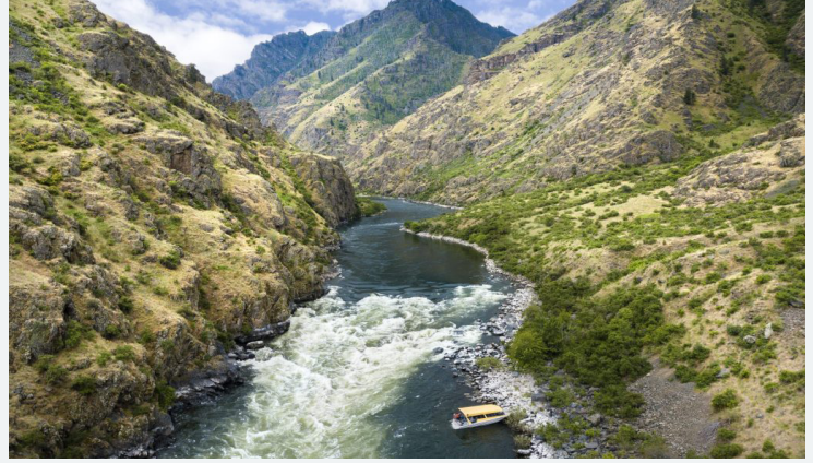
At 7,900 feet, Hells Canyon is the deepest river gorge in North America, even deeper than the Grand Canyon.