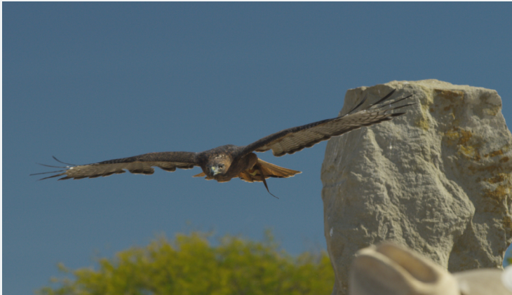
The world's densest populations of nesting eagles, hawks and falcons can be found at the Morley Nelson Snake River Birds of Prey National Conservation Area.