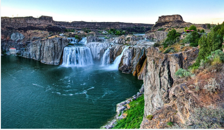
Shoshone Falls in Twin Falls is 212 feet high – 36 feet higher than Niagara Falls.