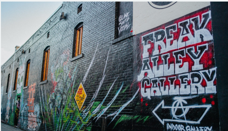
Boise’s Freak Alley is the largest, open-air mural gallery in the Northwest.