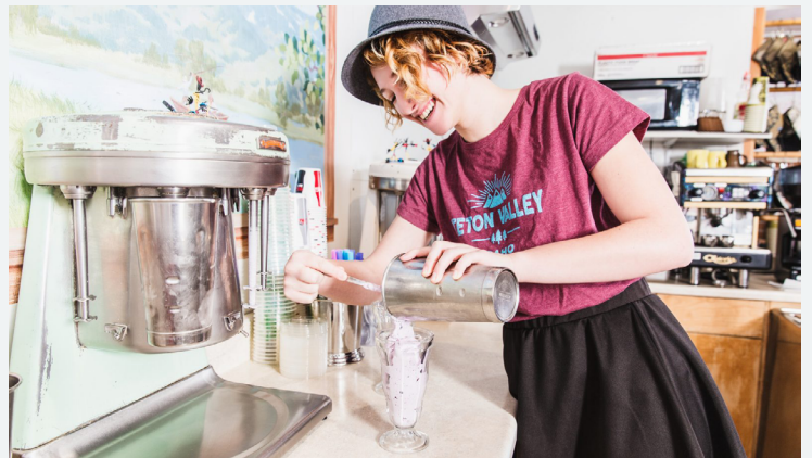
The Wild Huckleberry is the state fruit and can be found on menus throughout the region.