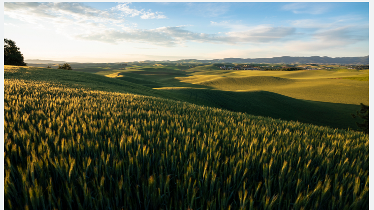
Idaho ranks 11th in breweries per capita with over 80 breweries statewide, and more in development. Idaho is the largest producer of barley and the second largest producer of hops in the U.S.