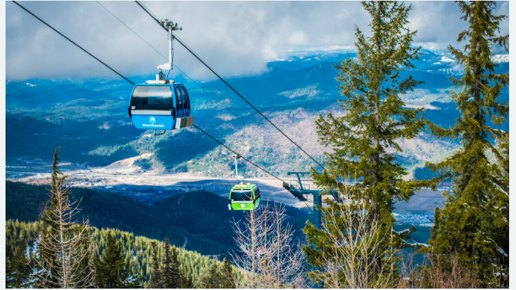
North America’s longest gondola ride can be found at Silver Mountain Resort in Kellogg.