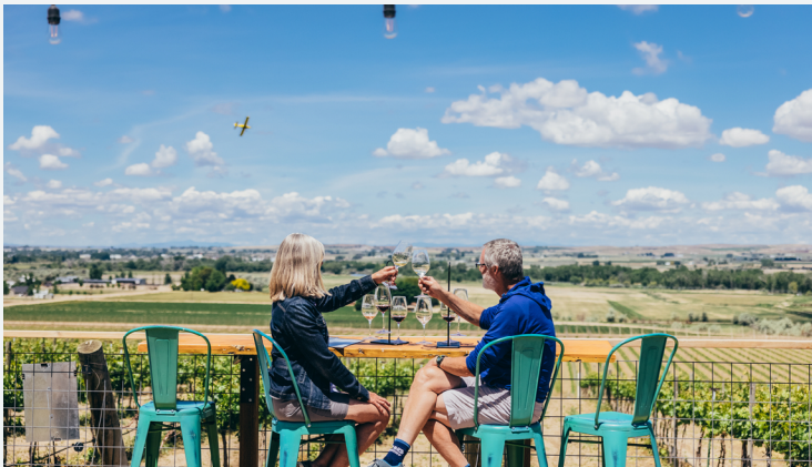
Idaho had a nationally-renowned wine industry until Prohibition closed it down. Today, it is Idaho’s fastest growing agricultural industry with three AVAs and more than 65 wineries.