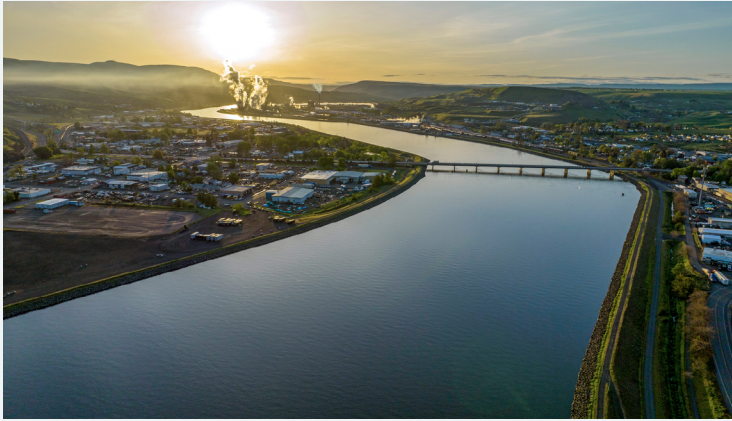
Lewiston is the most inland seaport on the west coast, welcoming cruise and cargo ships that travel up the Columbia River.

Idaho is known as the “Gem State” because 72 types of precious and semi-precious stones can be found here, including rare stones found nowhere else in the Americas.