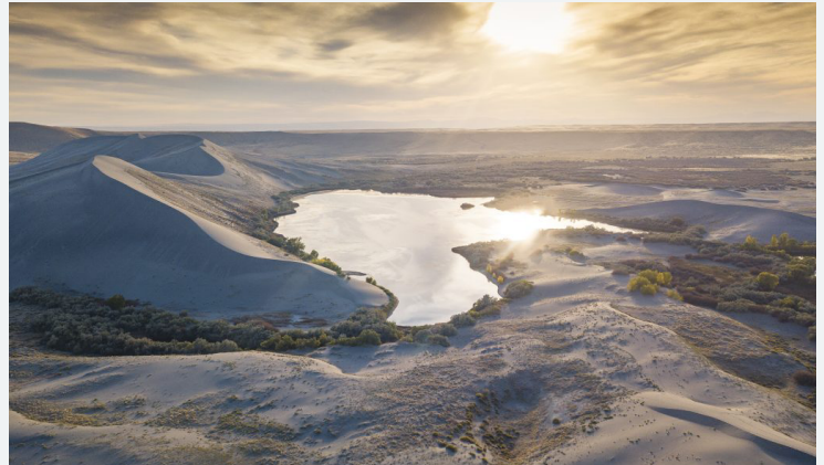
A sand dune within Bruneau Dunes State Park rises 470 feet above the surrounding desert floor, making it the tallest single-structured sand dune in North America.